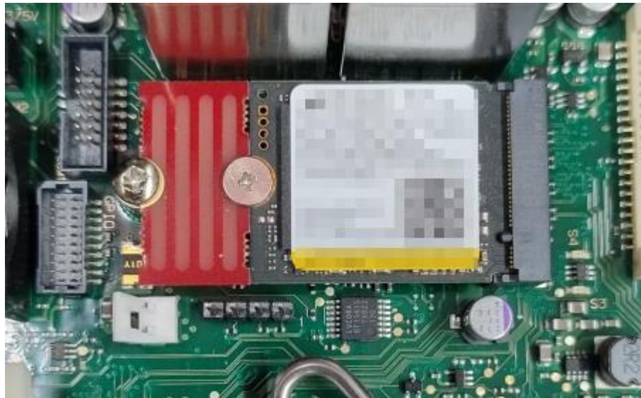
(Example picture of mounted and extended M.2 2230 module on K3832-Q motherboard)